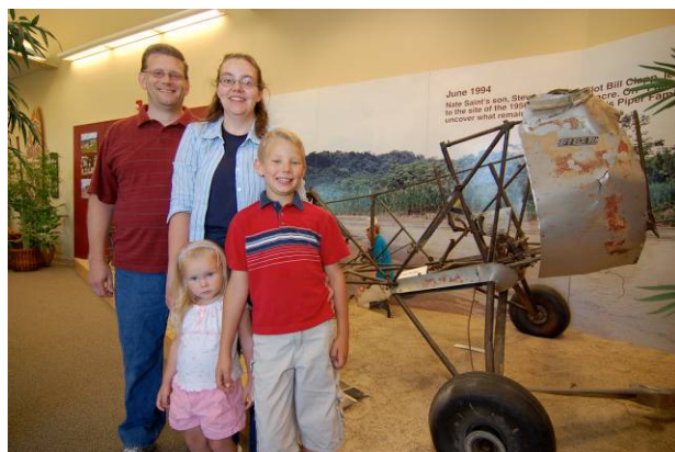
Our family in front of Nate Saint's airplane at the MAF home office in Nampa, ID last summer. We can't wait to get back!